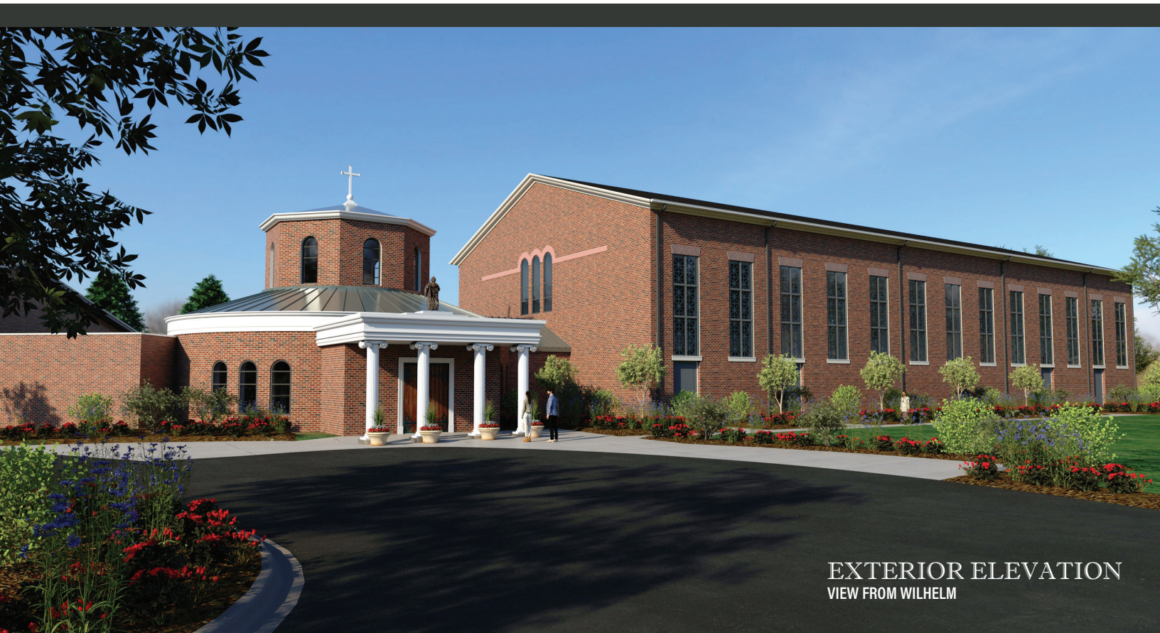
EXTERIOR ELEVATION VIEW FROM WILHELM

Please review the gift plans carefully and select one that fits your family's financial situation. Pledges are not legally binding, but rather the expression of your intent.